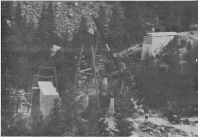
Overview of the new bridge with towers being raised to their positions on pilings. August 25, 1983.