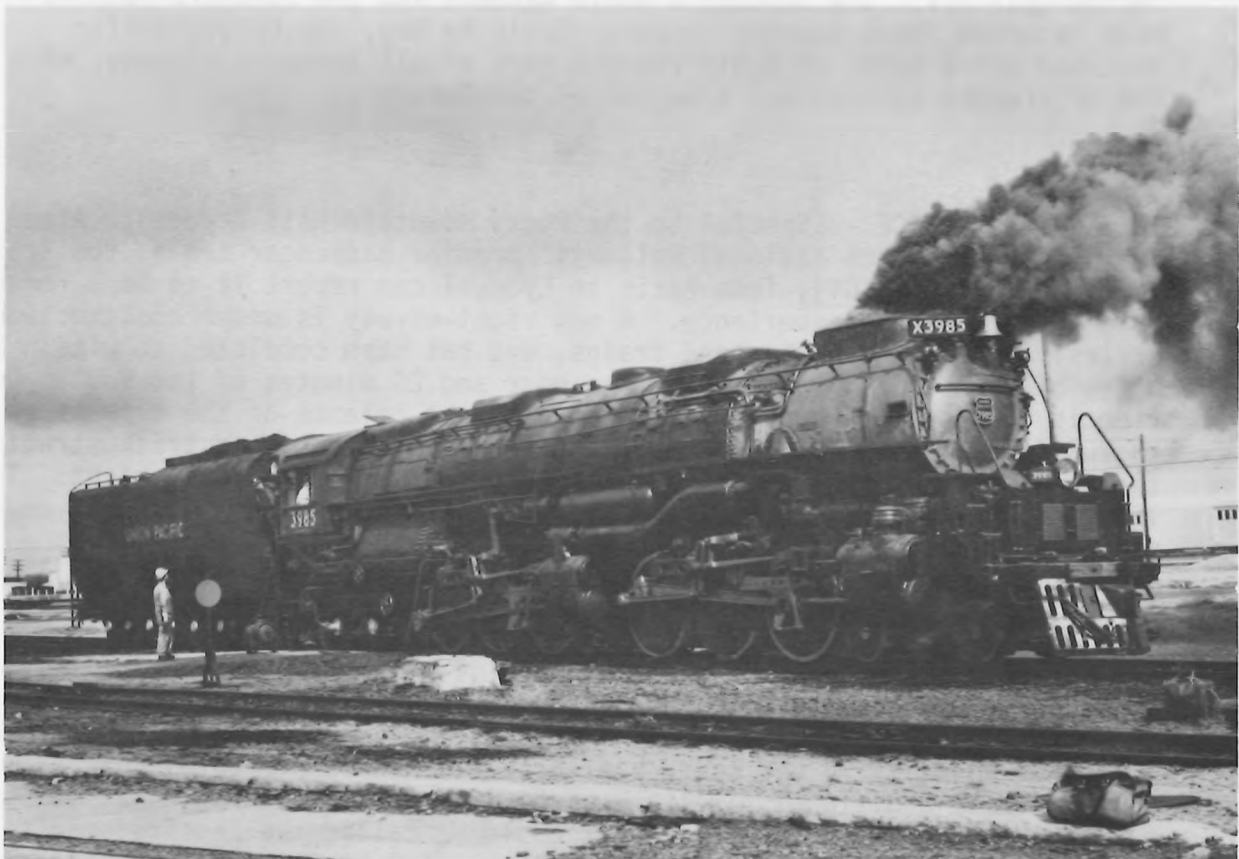
On Thursday, June 3, Union Pacific Locomotive No. 3985 was moved outside the Cheyenne roundhouse and put under steam. UP shop employees tested and made minor adjustments to various systems on the Challenger for its trip to Pocatello and Salt Lake City, while a few local railfans and a crew from Japanese television recorded the event.