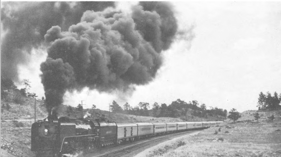
8444 nearing Perkins on the Harriman Line

Some of the Union Pacific's finest equipment will be provided. Our train will consist of a baggage car with safety boards across the side doors (which can be left open),