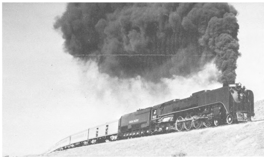
8444 rounds curve just south of Dent

de luxe coaches, a lunch-counter diner, and a fully stocked observation-lounge car. A convenient feature of this trip is that buffet-style meals will be served in the lunch-counter diner during the entire trip. All meals are included in the price of your ticket and they will be served on trays that may be carried to your coach seat. You may return for "seconds" as often as you wish.