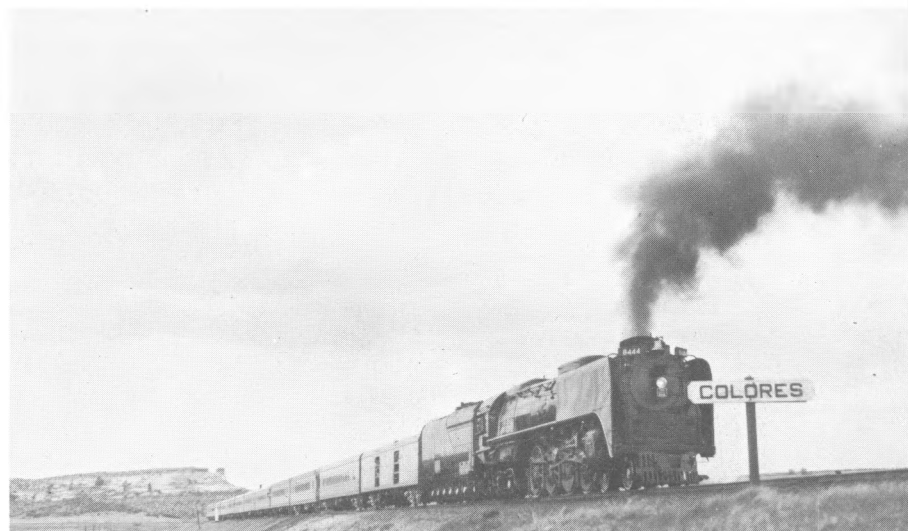
8444 passing Colores on Sherman Hill

Come along and ride in de luxe passenger equipment behind one of the world's greatest locomotives for over 300 miles of steam railroading. The round-trip fare for this excursion is $27.00 per adult passenger and $18.00 for children 6 to 11. See back page for additional ticket details and photo run information.