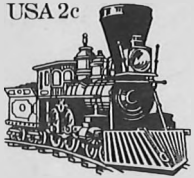
Locomotive 1870s USA 2c