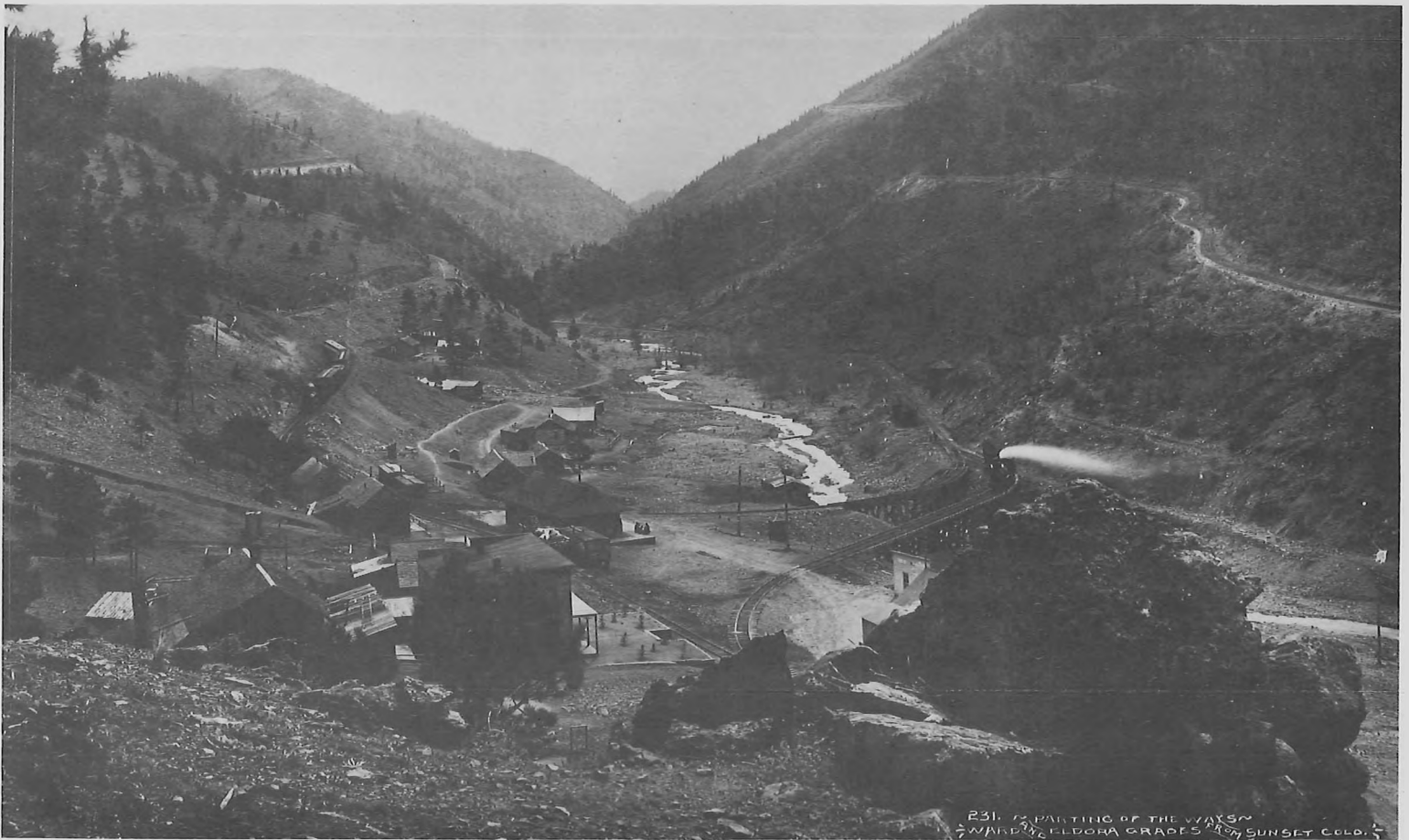
231. DEPARTING OF THE WARD WARD & ELDORA GRADES FROM SUNSET COLO.